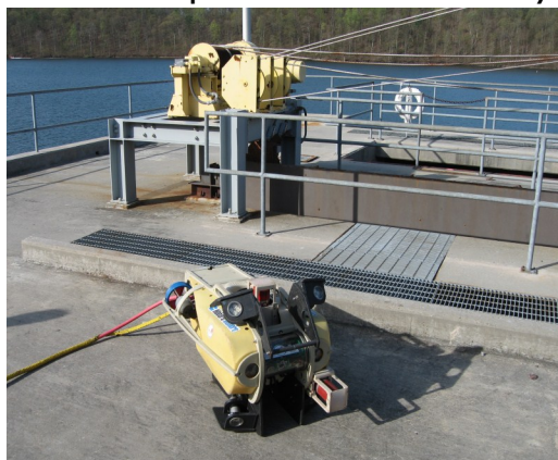
Inspection Vehicle with Sonar and Additional Lighting

The Hibbard advantage is that, along with highly experienced operators, we have a wide variety of vehicles and sensors to fit any level and physical length of project. Our objective is always to deliver more useful data to our customers at a lower cost. If you have an inspection, structural lifespan evaluation, debris removal project, or you need a bulkhead installation and you do not want to dewater or perform confined entry, please contact us for a quotation.